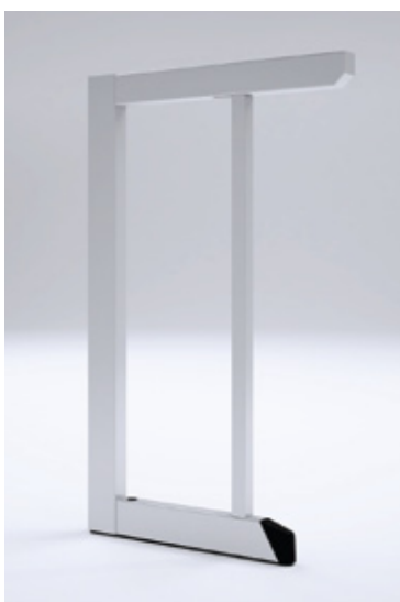
Retro fit front support leg for exceptional loads.

Push under and suspended storage cabinets include cupboards, drawer packs, sink units, tray units, waste bin units, acid and solvent storage/recovery units.